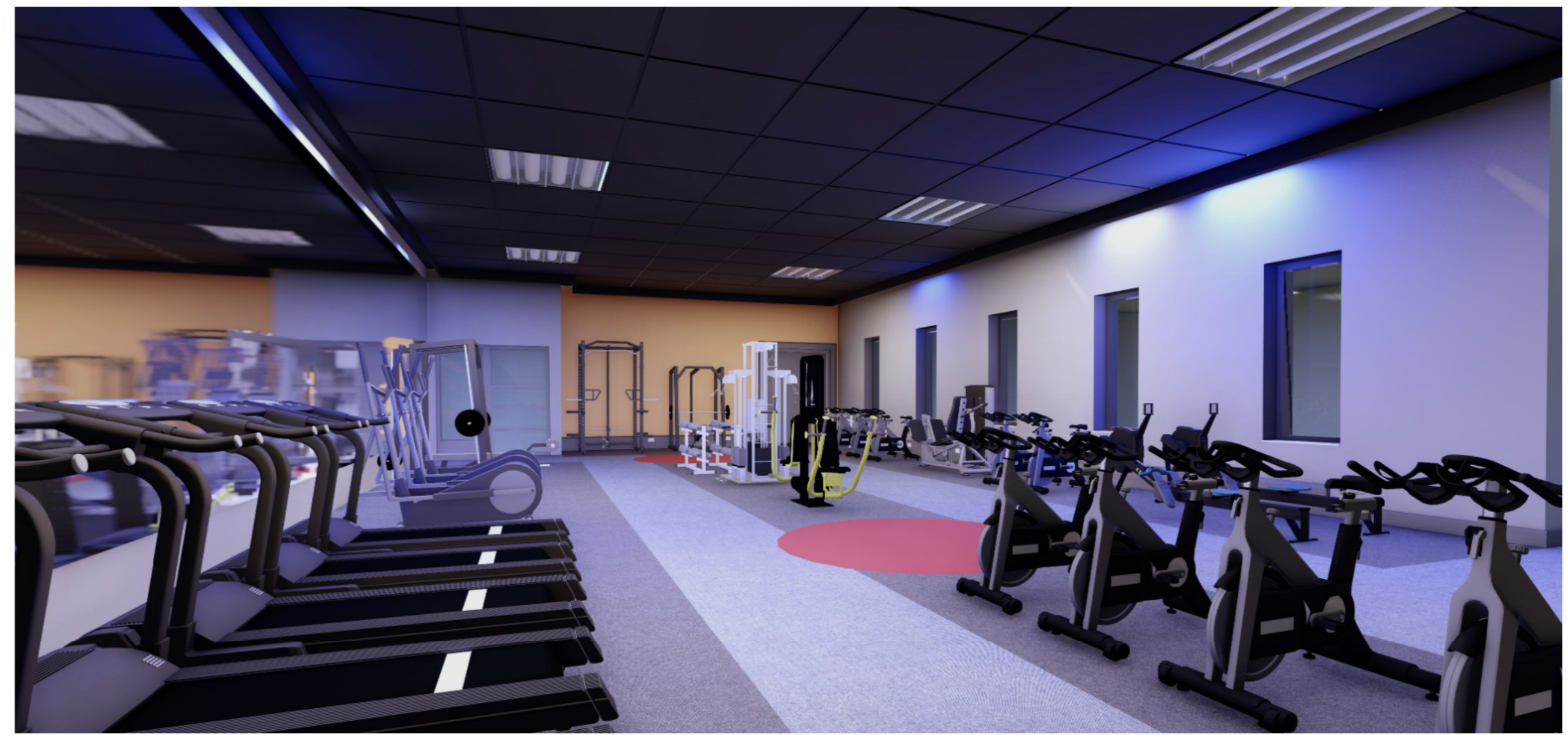
3D Main Gym room Artist impression View